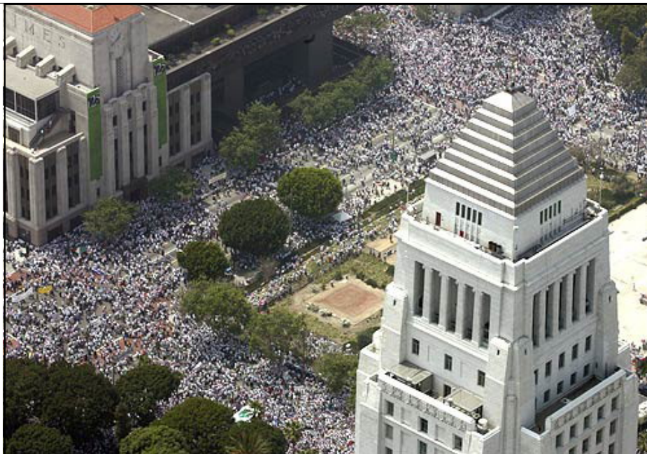
Millions of supporters of immigrant rights surround City Hall during a historic march in Downtown Los Angeles on March 25, 2006

The April 6, 2006 article went on to state that "At least 39 billion flowed out of the US last year, wired home by legal and unauthorized workers. . . . Mexico's annual remittance inflow has doubled since 2002 and reached 20 billion last year, second only to petroleum as a generator of wealth for the country. Brazilian laborers in Japan send home more than $2 billion a year, out-earning their country's coffee exports. India received $21.7 billion and China $21.3 billion last year from its workers abroad. In Jordan, Lesotho, Nicaragua, Tonga and Tajikistan, immigrant workers provide more than a quarter of the gross national product. . . . Remittance income is growing fastest in Eastern Europe, a trend that quickened as