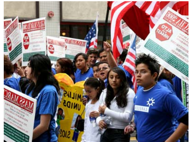
CARECEN youth and parents march up Broadway Avenue in Downtown Los Angeles on March 25 th , 2006. Many families who have been active with CARECEN for years